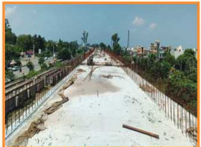
Deck Slab Casting in Progress