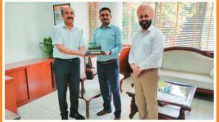
Meeting with Principal Accountant General (Audit) Haryana, Chandigarh