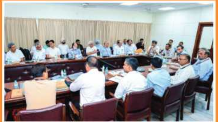
Technical Seminar on HORC Viaduct on April 26, 2023