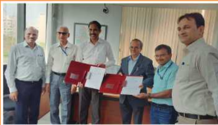
C-23 package contract signing on May 05, 2023