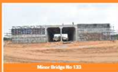
Minor Bridge No 133