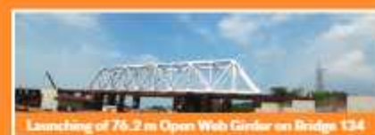
Launching of 76.2 m Open Web Girder on Bridge 134