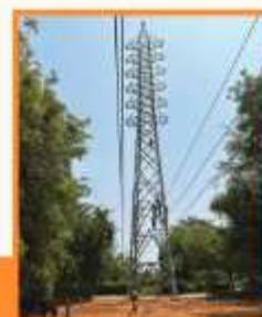
Utility Shifting in Progress

55 Nos. of LT/HT/EHT crossings shifted in HORC Part-A.