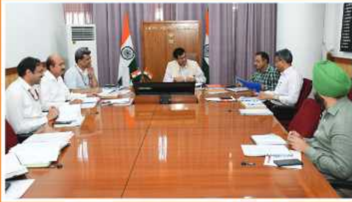
HRIDC Board Meeting on April 12, 2023