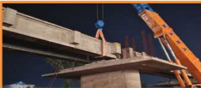
Launching of PSC Girder in Progress