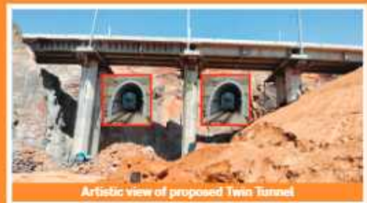
Artistic view of proposed Twin Tunnel