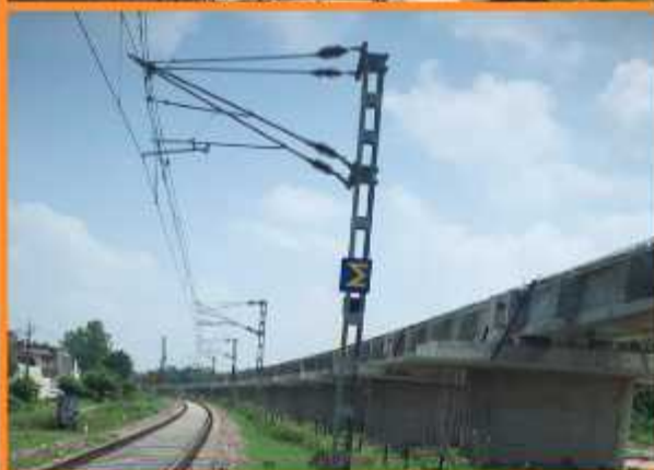
Launching of 228 PSC Girders completed