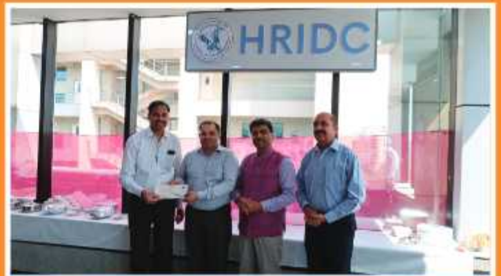
Birthday celebration of Employees during Dy.HODs Monthly Meeting