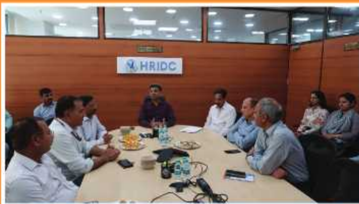
Celebration of Vikram Samvat 2080 on March 22, 2023