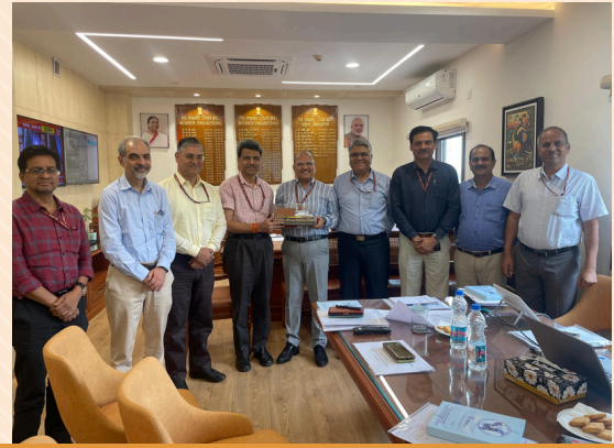
Meeting with Member Infrastructure, Railway Board