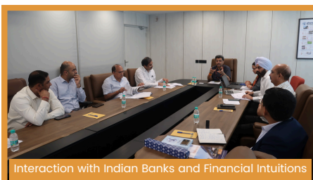
Interaction with Indian Banks and Financial Institutions

On 14.05.2024, HRIDC Gurugram hosted a meeting with representatives from major Indian banks and infrastructure financing institutions, including the National Bank for Financing Infrastructure Development, SBI, PNB, Canara Bank, IndusInd Bank, Indian Railway Finance Corporation, NABARD, and others.