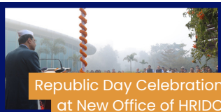
Republic Day Celebration at New Office of HRIDC

75th Republic Day was celebrated on 26.01.2024 in HRIDC with the National Flag hoisting by MD, HRIDC at the new office of HRIDC in Sector 32, Gurugram. On this occasion, family of HRIDC officers have also boosted the morale of HRIDC team by attending the Republic Day function. MD, HRIDC addressed the HRIDC team with the theme of 75th Republic Day i.e. 'विकसित भारत' और 'भारत लोकतंत्र की मात्रका' and motivated the team for achieving the HRIDC targets efficiently.