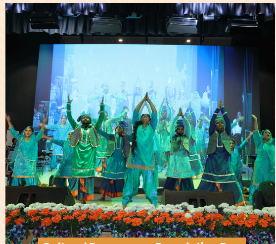
Cultural Program on Foundation Day