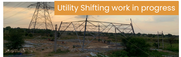
Utility Shifting work in progress