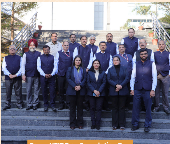
Team HRIDC on Foundation Day