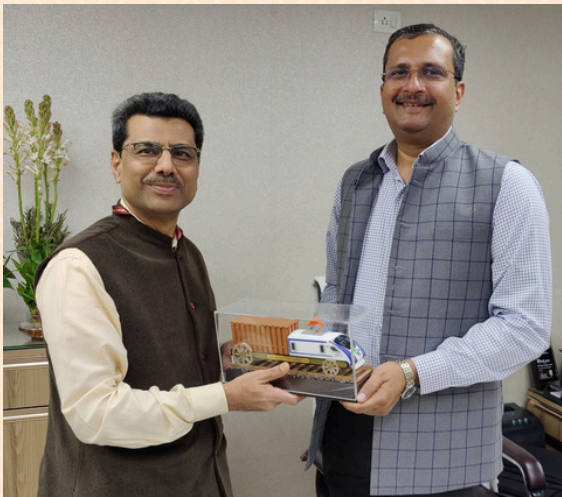
Visit to ACS/Housing /UP for EORC Project Feasibility