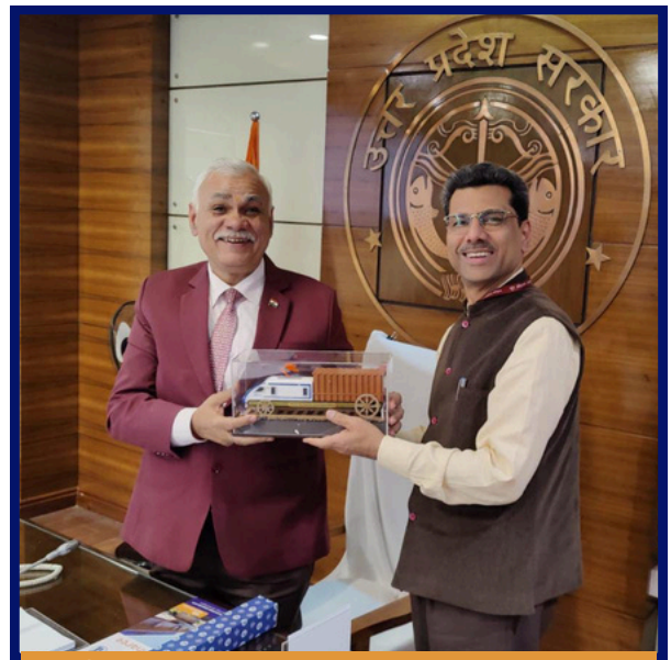
MD/HRIDC with Chief Secretary Govt. of UP