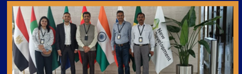
Team HRIDC at New Development Bank

These visits provided valuable insights into advanced rail systems. The team, led by ACS/PW(B&R)/GoH and MD/HRIDC, also visited the AIB Headquarters in Beijing and the New Development Bank Headquarters in Shanghai.