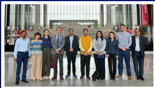
Team HRIDC at AIB