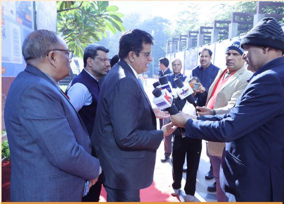
CS/GoH interacting with media on foundation day