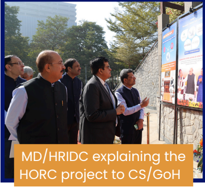
MD/HRIDC explaining the HORC project to CS/GoH