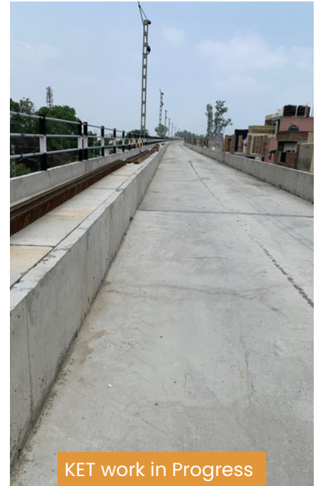
KET work in Progress

Revised estimate of the project at Rs.371.94 Cr. has been approved by Railway Board on 05.06.2024 with GoH share-Rs.206.32 Cr. & MoR share- Rs. 165.62 Cr.