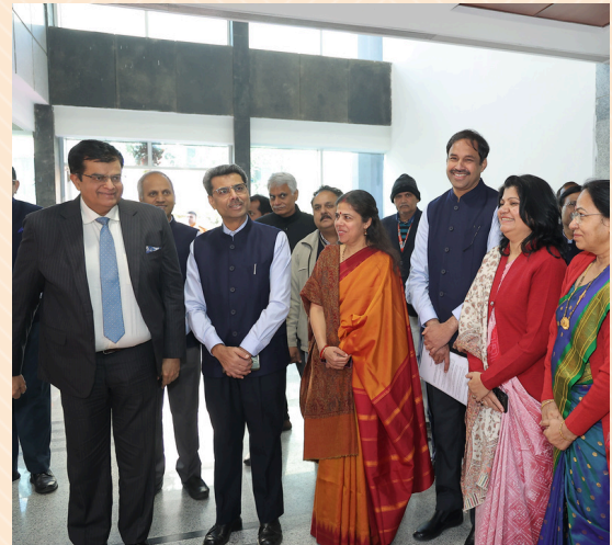
CS/GoH on inauguration of New Office